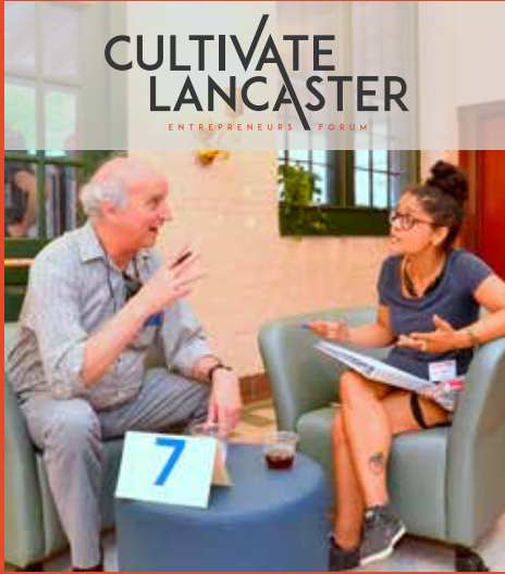
A SCORE mentor with a participant at the Cultivate Lancaster event. SCORE is also a member of the Lancaster Entrepreneurial Coalition.

Building on the success of the Cultivate Lancaster Entrepreneurs Forum, Lancaster City Alliance, in partnership with ASSETS, created the Lancaster Entrepreneurship Coalition in an effort to bring together non-profit, for-profit and government entities that specifically cater to entrepreneurs in start-up and micro-businesses.