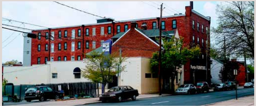
Former Porter Furniture warehouse at 626 Columbia Avenue has been converted to 24 market-rate apartments.

Directly following the presentation, LCA was notified that the team is invited to present at the Pennsylvania Chapter of APA this fall in State College.