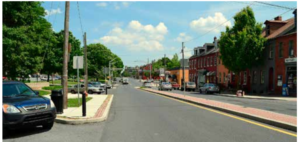
The S. Duke Street corridor (shown above) is primed for investment.

Lancaster City Alliance is working closely with the Spanish American Civic Association (SACA) and key stakeholders to leverage the Southeast Lancaster City area Elm Street designation. The Elm Street designation does not provide funding; it gives the Southeast priority consideration for program funding and technical assistance for building community structure to achieve the Southeast Plan goals. Several projects and opportunities paired with the Elm Street designation present remarkable opportunities for this corridor and