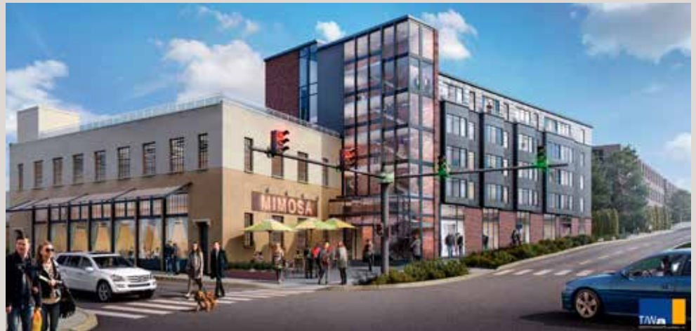
The recently announced “Tobacco Avenue” project will bring a mix of new uses to the southwest corner of N. Plum and E. Walnut Streets.

For additional details on plan progress, including more information on the 21 specific recommendations underway, please review the most recent Building On Strength Quarterly Report available at www.lancastercityalliance.org/building-on-strength/ . A full two-year progress report will be released in the summer of 2017.