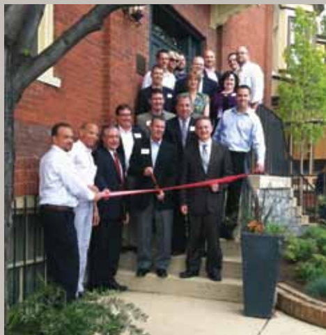
RGS & Associates ribbon cutting