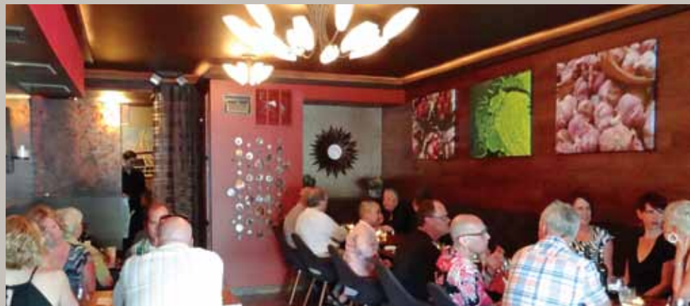
Diners enjoy the new Citronnelle restaurant on Orange Street.

building at Prince and Lemon Streets (with on-site Café Di Vetro soon following this summer). Further south on Prince Street, Lavon Films, Planned Perfection Event Planning, the JDK Group and Tennis Photography all recently opened in shared office space at 21 N. Prince Street.