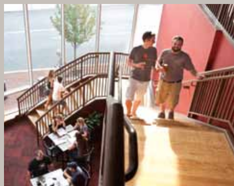
View from second floor at the Federal Taphouse.

over a block away from their original location. Tellus360 has embarked on a major expansion to include a recording studio, performance venues and a café.