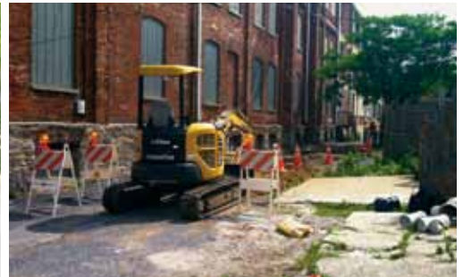
Top: Preparations for new trees on W. New Street. Bottom Left: Three of the 19 street trees planted in the Elm Street neighborhood this spring. Bottom Right: Green Alley under construction.

installation of an infiltration trench and restoration of the alley surface with porous pavement, a significant improvement for neighbors who use the alley for access to rear parking areas.